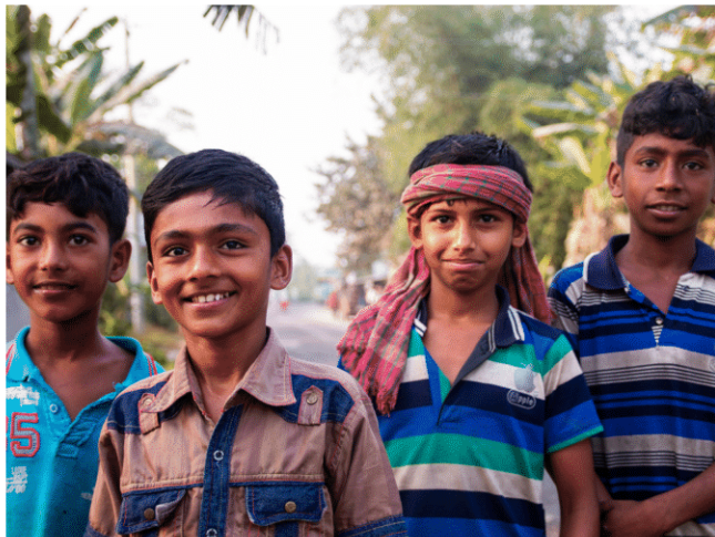
The present and the future potential right here in these kids eyes who live in the villages. They've got hopes and dreams!