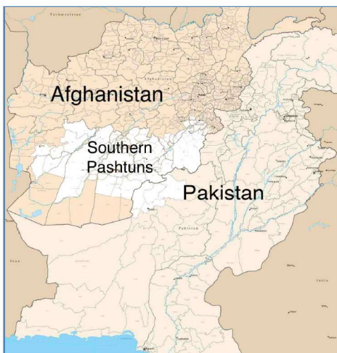
Southern Pashtuns live primarily in south central and southeastern Afghanistan.