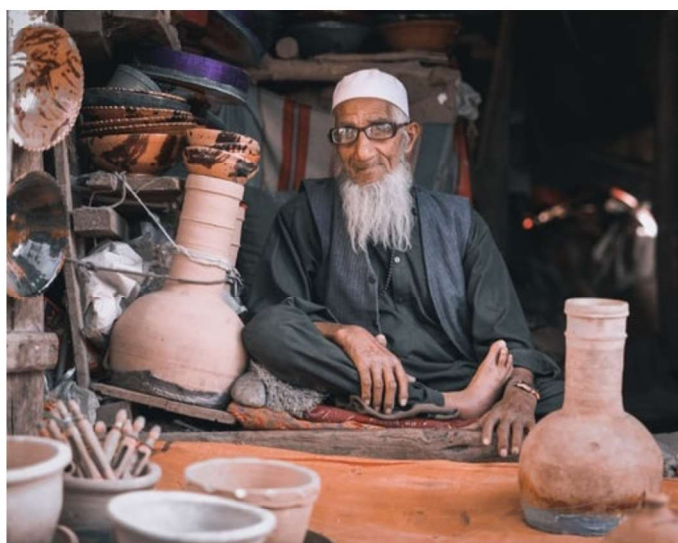
This Pashtun shopkeeper makes a meagre living selling water jars, glazed bowls, and mortar and pestle sets.

- Ask the Lord for vocational opportunities for foreign workers in areas with Southern Pashtuns, and for meaningful relationships and witnessing opportunities for those engaged in outreach to this people group loved by God.