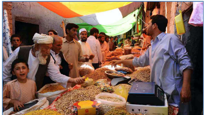
Markets selling dried fruit and nuts are commonplace in Pashtun cities.

Gospel resources: Jesus Film and Magdalena video in Southern Pashto; no Scripture portions have yet been translated into Southern Pashto.